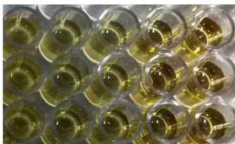
Figure 1 Antibacterial test of moringa oleifera on staphylococcus aureus (96 well plate) first well is medium + bacteria, next well drug with low doses (0.5) to high doses (3.9). Last well is medium

Agar diffusion method; the antibacterial activity of M. oleifera samples used paper disc diffusion method. The liquid broth was obtained by using following procedure. 3.9 g Nutrient Broth (NB) was added by 300 mL distilled water and mixed with 4.5 g Nutrient Agar. The mixing solution was liquefied in autoclave for 20 minutes. Each 15 ml mixing solution was positioned in petri dish. The petri dishes were left in the UV light for 24 hours.