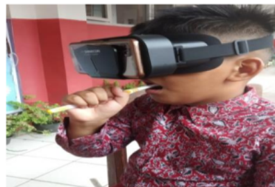
Figure 2. A student demonstrates how to brush their teeth in the VR video.

The Wilcoxon test results in Table 5, p = 0.000, 0.000 < 0.05 reject H_0 and accept H_a . Therefore, it can be concluded that education using Virtual Reality video media is effective in improving the oral hygiene status of students at State Elementary School 10 Sungai Sapih Padang City.